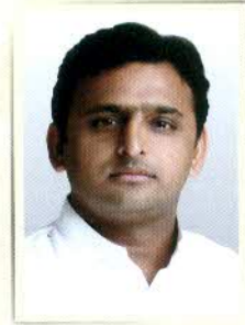
Mr Akhilesh Yadav Hon'ble Chief Minister, Uttar Pradesh